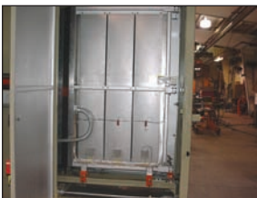
Roll Away Oven