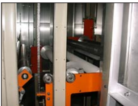
Variable Speed Rollers