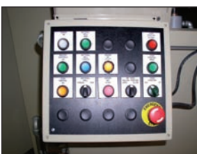
Easy Operator Controls